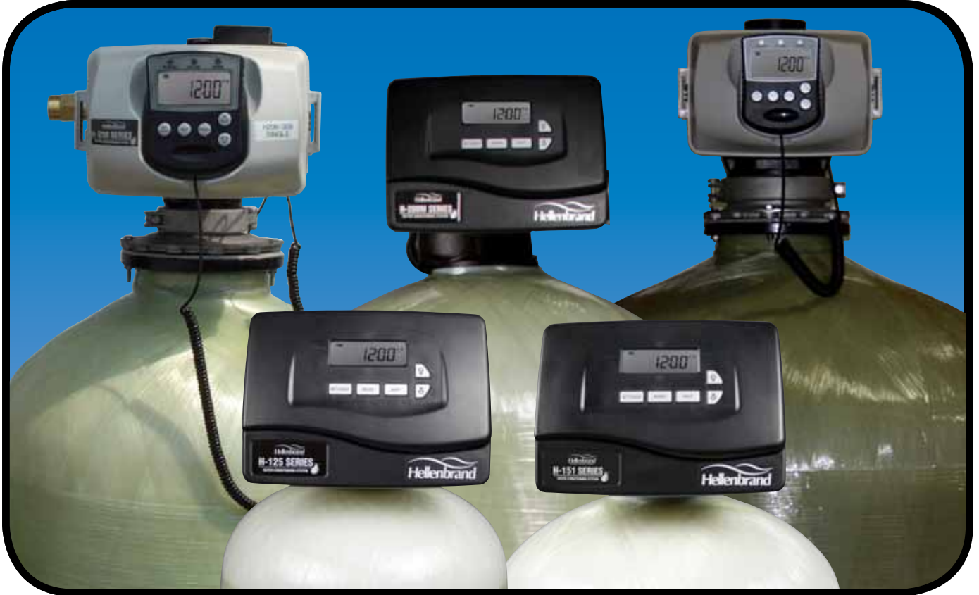
The H-Series Family H125, H151, H200, H200M, H300